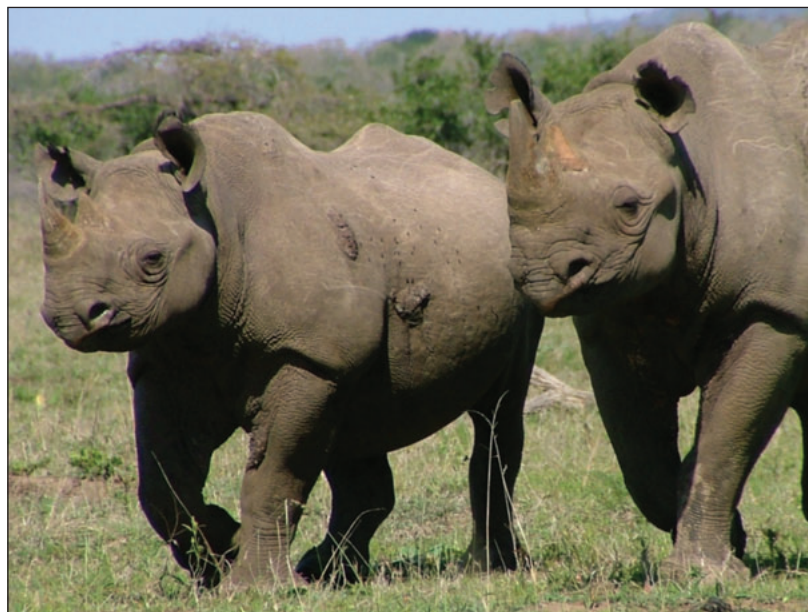
Figure 2. Black rhinoceros ( Diceros bicornis ) populations have benefited greatly from metapopulation management through translocation. Excellent record-keeping by government biologists and private partners has enabled the resulting data to be analyzed and applied for management.

Determining the effectiveness of mitigation-based translocations is often complicated by the absence of gov-